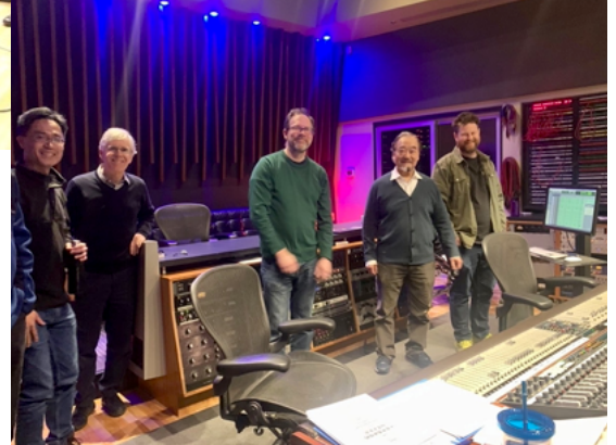
Degazio Recording at Calvin Presbyterian